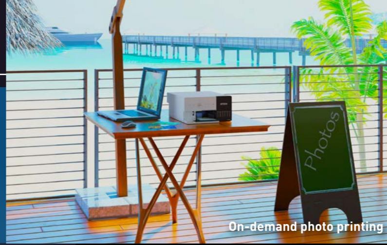
On-demand photo printing

Maximise what your business can offer with the sturdy and compact Epson Surelab SL-D530. Perfect for photo retailers, self-service photo kiosks, self-photo studios, and on-demand photo printing operators that need quick and high-quality on-the-spot photo printing.