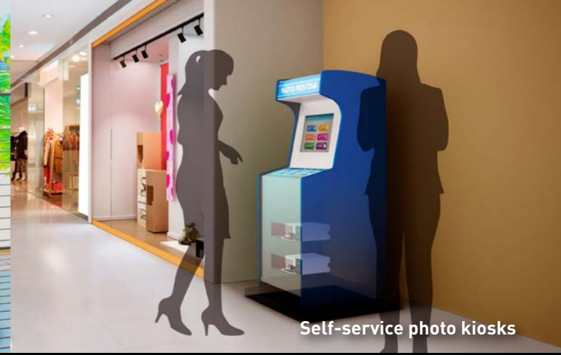
Self-service photo kiosks